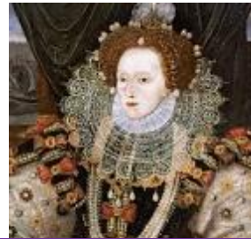
Queen Elizabeth I born in 1533

We will understand how everything we have learnt in history fits in to a chronological framework. We will learn about our current queen (Queen Elizabeth II) then we will look at queens from the past such as Queen Elizabeth I born in 1533 and later Queen Victoria in 1819.