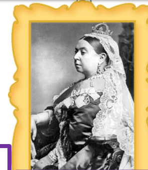
Queen Victoria born in 1819