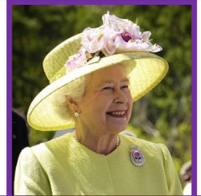
Our current queen Elizabeth II born in 1926